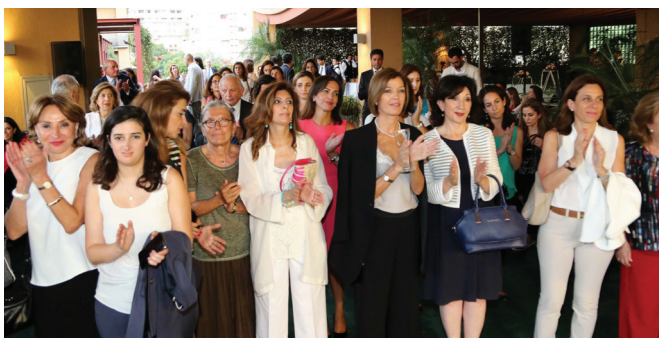
AIWF Special Reception in Beirut Guests

The evening was a resounding success for AIWF and was attended by over 100 guests representing a diverse range of private sector, governmental and non-profit organisations including the Ministry of Finance; American University of Beirut; Credit Libanais; Berytech; Lebanese Council for Women Affairs; World Bank Lebanon; PwC Lebanon; Global Compact Network Lebanon; The Peace and Prosperity Trust; US Embassy Beirut; Ministry of Justice Lebanon; International Labour Organization; BBC; Institute for Women's Studies in the Arab World (IWSAW); Union of Arab Chambers; Institute for Human Rights of the Beirut Bar Association; and Unilever Levant, among many others. Expressions of thanks and appreciation for the event were voiced by many of the guests attending.