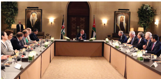
EWI Audience with His Majesty King Abdullah II of Jordan

2018, recording a personal video message honouring the work and truly global impact of the WLB. I have been a member of the Harvard Women's Leadership Board for nearly 15 years, and I am very proud to serve on this Board alongside an outstanding group of women leaders all doing amazing work, from the US and increasingly internationally, representing government, business, academia and the non-profit sector. As one of the first Arabs to be invited early on to join the Harvard Women's Leadership Board, I am absolutely dedicated to and very active in supporting the next generation of women leaders. I have especially enjoyed building long term friendships with likeminded members of the WLB and to have had the opportunity to meet so many inspirational women leaders in all fields and from so many different countries.