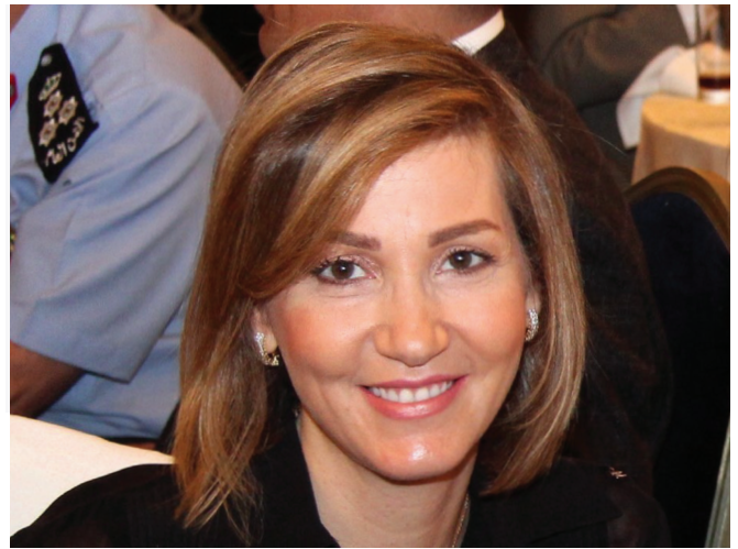
Dr Dima Jamali Member of Lebanese Parliament; Professor of Management and Kamal Shair Endowed Chair in Responsible Leadership in the Olayan School of Business, American University of Beirut; and National Representative of the Global Compact Network Lebanon

In just under three years, under Dr Jamali's leadership, the Lebanon network has grown and become one