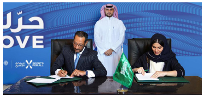
The two-year partnership supports Saudi Vision 2030's ambitions of championing a more active lifestyle in the Kingdom of Saudi Arabia

Through its 'Winning with Purpose' mission, PepsiCo continues to support healthier and more balanced lifestyles in conjunction with efforts to reduce sugar, saturated fat and salt across its product portfolio. In addition to increasing sports participation, Saudi Arabia's bold Vision 2030 aims for sports to contribute 0.8 per cent to the economy and help to create an environment that allows for 50 Olympic athletes by 2030. Earlier in the year, PepsiCo further solidified its commitment to the Kingdom by pledging a projected SAR 1.6billion investment over the next five years.