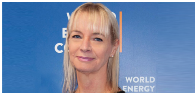
Dr Angela Wilkinson, Secretary General & CEO, World Energy Council, addressed the AIWF Webinar 'Humanising Energy' in early November 2020

Even before COVID-19, the energy sector was undergoing immense transformation in the face of climate change and the transition to renewable and clean energy solutions. In 2020, across all regions, the dual impact of climate change and COVID-19 has accelerated major change in the oil and gas sector