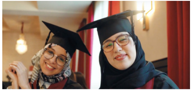
EFE's innovative programmes aim to create economic opportunities for unemployed youth in the MENA region

EFE focuses on the demand side, partnering with businesses that need qualified employees with young women and men seeking employment. Since 2006, locally-run EFE Affiliates in Egypt, Jordan, Morocco, Palestine, Tunisia, Saudi Arabia and Yemen, with support hubs in the USA, Europe, and the UAE, have connected more than 111,000 youth to the world of work while providing 3,000 businesses with the entry-level talent they need to grow. Over 57% of EFE's