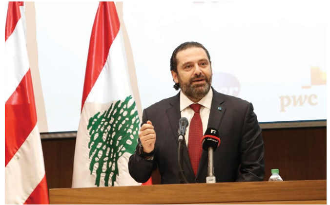
HE Mr Saad Hariri, President of the Council of Ministers of Lebanon, delivered the Guest of Honour Keynote Address at Women Leaders & Health in Beirut in April 2019

The conference was an outstanding success for AIWF, UMMS, AUB and all valued stakeholders, bringing into focus key challenges and opportunities for women's leadership in medical education, healthcare delivery, STEM, research, innovation, sustainability and international development and drawing the Arab public and private sectors, international development organisations and institutes, civil society, women and youth together.