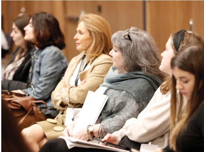
Delegates of the AIWF Women Leaders & Health Conference in Beirut

In June 2019, following the highly successful conference in Beirut on Women Leaders & Health , AIWF was proud to launch a Special Report which documents the high-level and impact-oriented recommendations to emerge from the conference and workshop discussions that took place in Beirut on 17 - 18 April 2019.