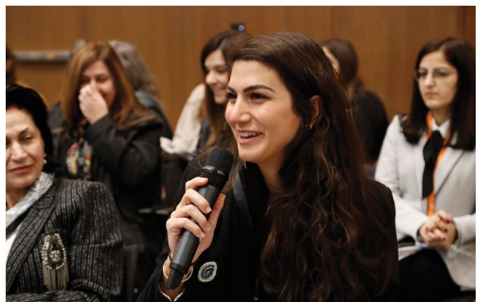
AIWF Women Leaders & Health Conference in Beirut in April 2019

The workshop sessions that followed brought together leaders in public service, international development and global advocacy to discuss the impact that the refugee crisis in the MENA has had on women in vulnerable and conflict situations in the region, and to provide insight into how these challenges can be mitigated through multi-level engagement, concerted action and dialogue. Sessions included: Challenges to women's health and family planning under conflict; Dying by displacement: Vulnerability, maternal mortality and the making of maternal ill health; Interventions that work: Maintaining services at times of donor fatigue , with a concluding discussion titled Towards models of maternal health support , which gathered all panel speakers and specialists together with a high and rich level of extended interactive Q&A from the audience.