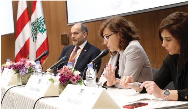
The Women Leaders & Health conference and workshop produced a Special Report & Recommendations launched by AIWF in June 2019, now available for download from the AIWF website in English and Arabic